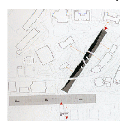
figure 4 Ewha University, Site plan, 2004

Therefore, it could be considered that this "violently" inserted void is the "section of land" which has been created as a facade supporting the existing natural surroundings and the established landscaping (roof-garden) originating from the practice of making distinct boundaries between indoors and outdoors. However, this void maintains an interactive dynamic relationship or relative relationship in that it becomes both exterior space and interior space, depending on how it is viewed, rather than have definite border. In particular, this gigantic void demolishes the perceptual boundary between figure and ground, postponing the initial statement on the self-space concept toward the entire campus. In other words, this in-between space