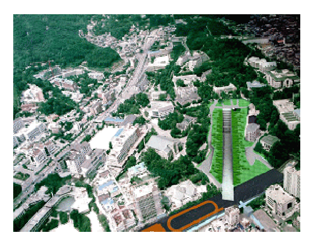
figure 3 Overview of the ECC with the context

A Paradox of indoor / outdoor: This "solid wall space" designed by Dominique Perrault, bisects the existing campus both visually and physically. One is imprisoned within the existing structure (campus) and the other stays in the outside of the structure (city). These two elements are separated in content, yet coexist in their entirety, building a structure of dialogue. However, at the same time, they offer placeness that is ready to depart from the existing situation at any time. This tension created by academy and the city establishes the passage between interiority and externality and between reality and imagination. This space is an in-between zone which is neither interior not exterior, and at the same time both inside and outside. Moreover, depending on how it is viewed, it could be either inside or outside. In other words, this space is a