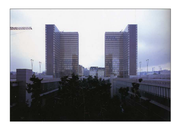
figure 2 Bibliotheque nationale de France, Paris, France, 1989